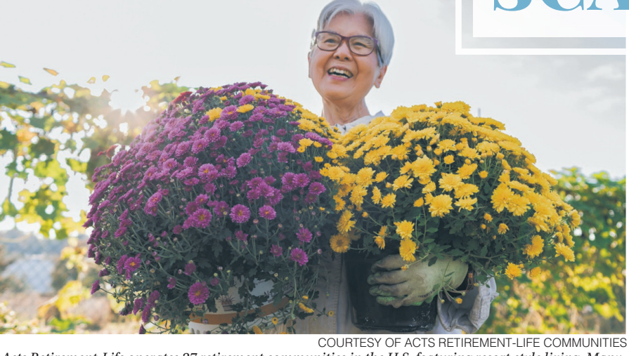
Acts Retirement-Life operates 27 retirement communities in the U.S. featuring resort-style living. Many of these campuses are located in quiet suburban areas that still have close proximity to the vibrancy of